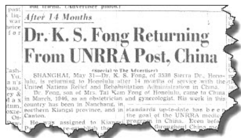
Articles about returning UNRRA workers